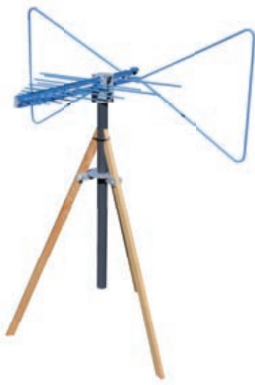
UPA 6192 on tripod CTP 6098